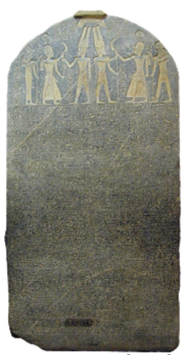
Figure 5. The Merneptah Stele, ca. 1205 BCE58 The stele famously (and probably falsely) claims that "Israel is laid waste, his seed is no longer"

Does the idea that some of the Israelites were already in Canaan when the others arrived help us in finding a date for the Exodus? No. Although Friedman's interpretation of events has important implications for the dating of the Exodus, it actually widens rather than narrows the options for the range of likely dates.