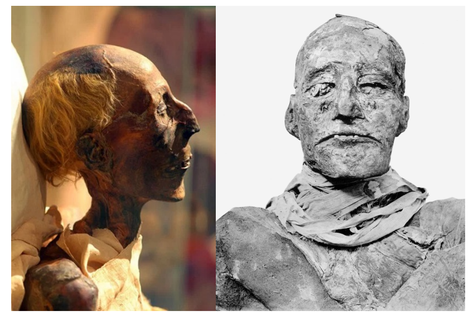
Figures 7a, b. Heads of the mummies of Ramesses II and Ramesses III.71

Ramesses II was a successful builder of great cities, temples, and monuments and died at the age of 90 or 91. By way of contrast, Ramesses III presided over Egypt's decline. His reign was marked by constant war and exhaustion of the treasury that were belied by the image of continuity and greatness projected in his own monumental building program.72 A conspiracy apparently ended his life as well as that of another man buried with him — presumably his son Pentaweret. A study reported in part in the British Medical Journal "stated that conspirators murdered pharaoh Ramesses III by cutting his throat."73 Hence, the "excessive bandages" around the neck of his mummy.