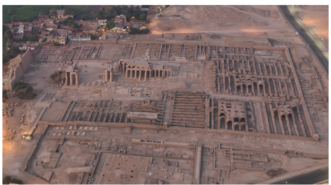
Figure 6. The grand mortuary temple of Ramesses II which has come to be known as the Ramesseum. The annual flooding of the Nile contributed to its current ruined state.

The Merneptah stele confused things as long as people were picturing the entire nation of Israel making the exodus. They had to picture the exodus taking place long before Merneptah's time: with millions leaving Egypt, journeying through the Sinai wilderness for a whole generation, arriving and conquering and settling in the land, all without leaving a sign in Egypt, Sinai, or Israel of any of those things happening. But as we [have seen], if it was [a smaller group], then their exodus could have been before or after Merneptah. The stele is still important. It just does not happen to be evidence for the date of the Exodus. It is not evidence that Israel was in Egypt. It is evidence that Israel was in Israel! What matters — matters enormously — is that Israel the people [were] already there when the [group from Egypt] arrived.