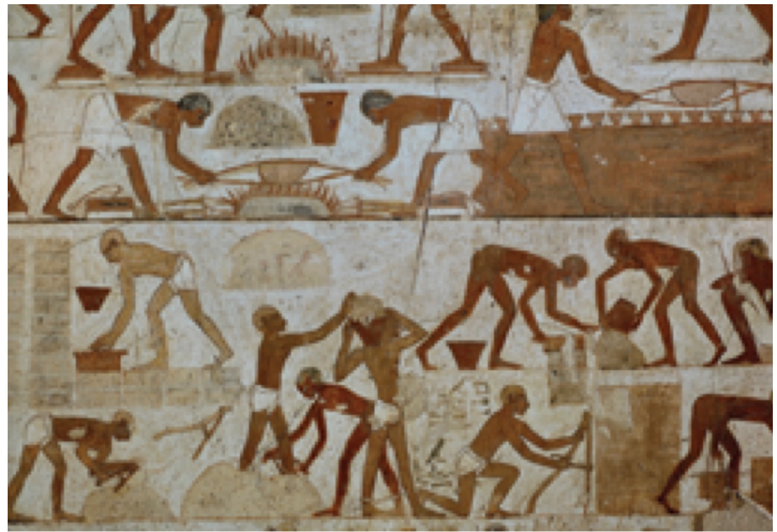
Figure 2. Wallpainting of Brickmaking in the Tomb of Rekhmere, vizier under Pharoahs Thutmosis III and Amenophis II.3