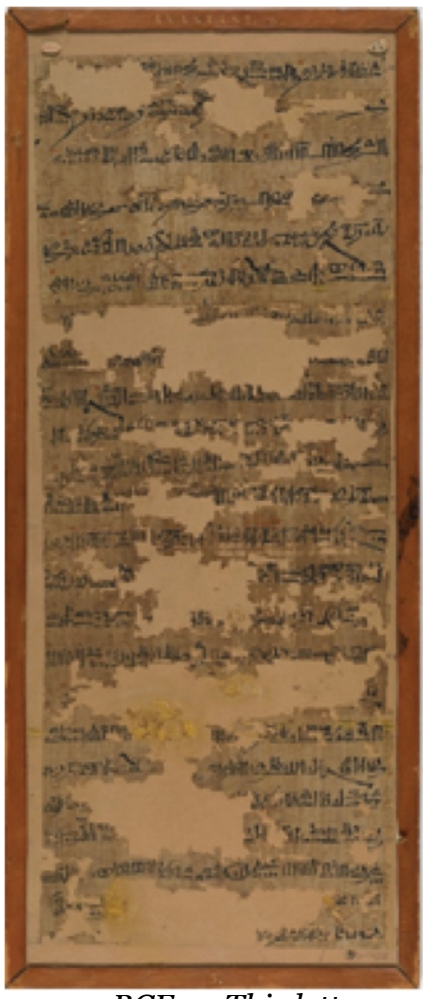
Figure 3. Papyrus Anastasi VI, ca. 1200 BCE.25 This letter, possibly a model for the instruction of Egyptian scribes, mentions a group of Semitic nomads (Egyptian shasu) coming from the Sinai desert. "While the shasu mentioned here are probably not Israelites, the text does show is that it was not unusual for nomadic Semites to enter Egypt at this time especially along the eastern border of the Delta."26