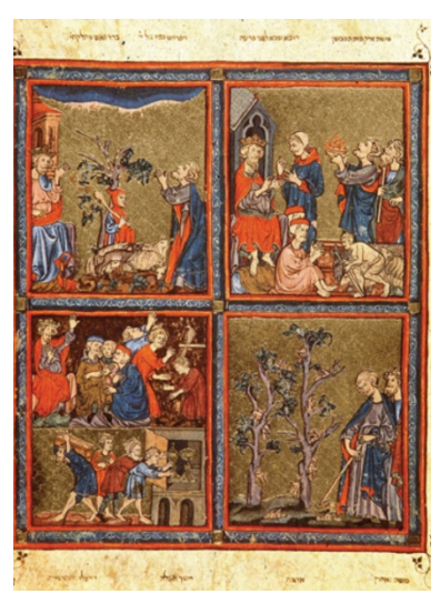
Figure 4. Four of the plagues as depicted in the Golden Hagada, an illustrated Hebrew manuscript from Spain, 1320 CE46

According to Friedman, it's a viable possibility that "these Levites had originally come from Israel (probably called Canaan at that point) themselves, so their uniting was actually a reuniting with their old brethren."45 The same would have applied to any others of the family of Jacob who were part of the Exodus.